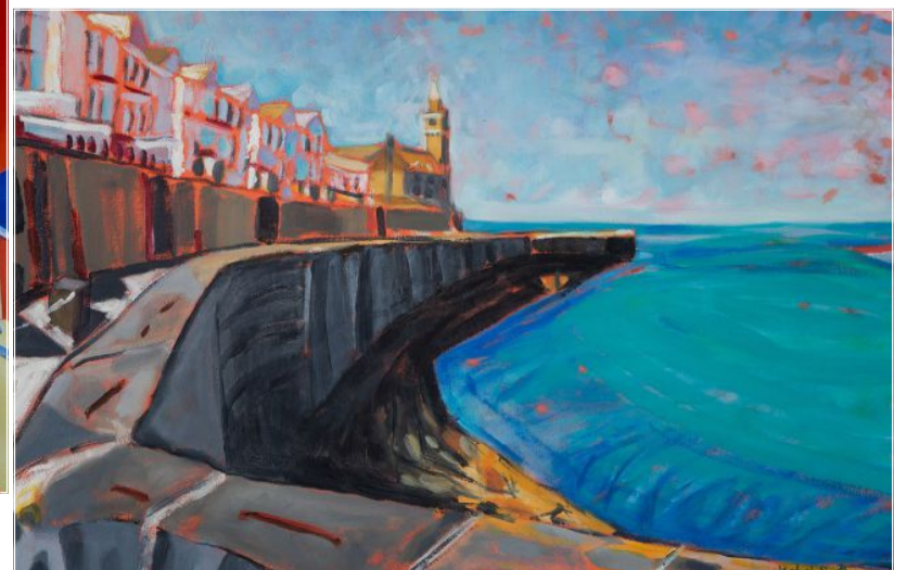
Clockwise from top: Shapes & Patterns 2, Mousehole, Harbour Walls Porthleven and The Artist's Kitchen 2